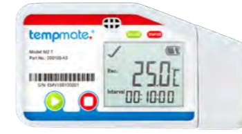
Main Technical Specifications tempmate.®-M2 TH