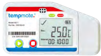
Main Technical Specifications tempmate.®-M2 T